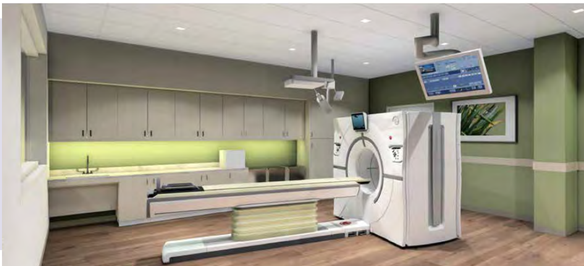
Outpatient Diagnostic Center – CT Scan Room

Emergency Services – We offer excellent, compassionate emergency services which we continue to improve, such as recently with Acute Stroke Ready Certification and access to UCSF Health physicians through telemedicine. We will continue to reduce wait times and improve the efficiency of the patient visit with access to state-of-the-art diagnostic technology. We will expand our commitment to emergency services by educating our community so they understand how vital the hospital is in saving lives and its preparations to help with natural disasters.